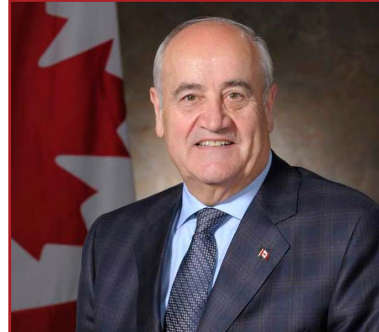
KEY NOTE SPEAKER The Honourable Julian Fantino, Minister of International Cooperation