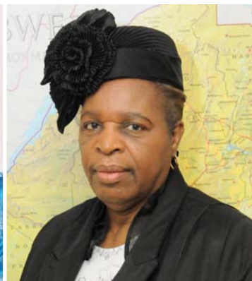
Her Excellency Florence Zano Chideya, Ambassador of the Republic of Zimbabwe & the Dean of African Diplomatic Corps